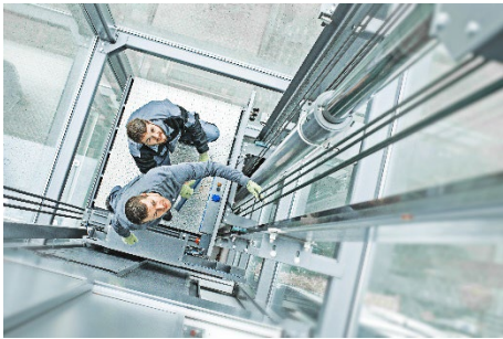
Dussmann Technical Solutions: Elevator technology