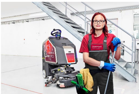
Dussmann Facility Management: Robotics in building cleaning