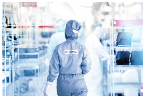
Dussmann Facility Management: Cleanroom cleaning