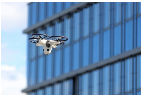
Dussmann Facility Management: Drones used for security service