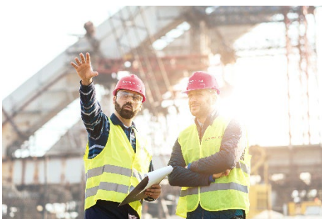
Dussmann Technical Solutions: Electrical engineering