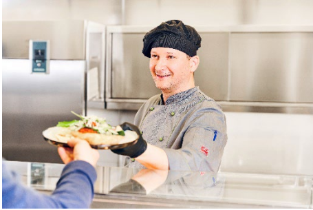
Dussmann Food Services: Employee food service