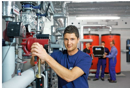
Dussmann Technical Solutions: Cooling and air conditioning technology